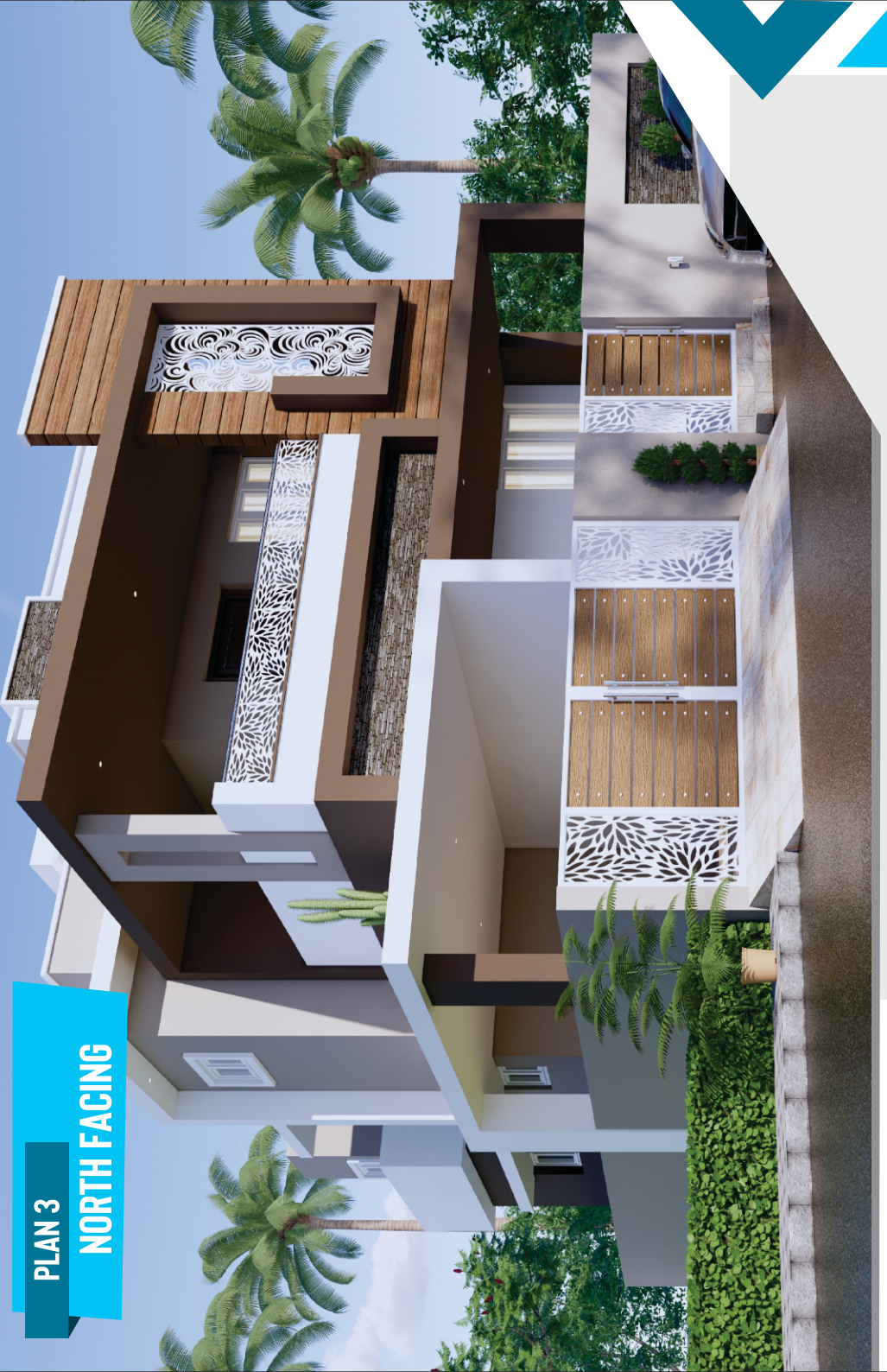
GROUND FLOOR PLAN NORTH FACING PLAN - 3